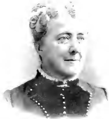
JENNIE FOWLER WILLING.